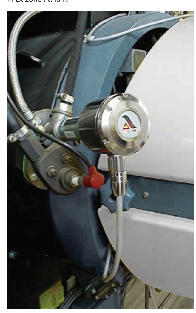
The LAMTEC F200K flame scanner in operation.

The F200K consists of a cylindrical case containing an integrated flame sensor and circuit amplifier. Light enters on the axis. Users are able to make all settings independently. The device has received the IP67 protection rating and, as a result, is suitable for use in dusty or damp working environments. In addition to the standard design, it is also available in designs certified for use in Ex Zone I and II.