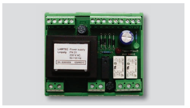
FN20 for top hat rail assembly FN20 in the connection housing with FSB connector, not shown.

The FN20 power pack includes an output relay adjusted for connecting the F200K compact flame scanner to 230 V or 115 V mains AC voltage. It must be installed in a way that enables it to attain an IP40 protection rating. The FN20 power pack is also available in an optional IP65 case.