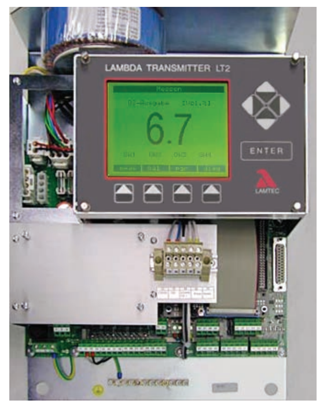
LT2 on IPOO mounting plate.