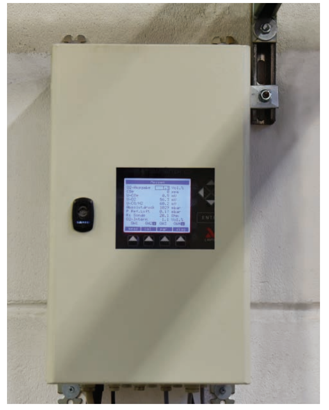
LT2K with integrated reference air pump.

The LT2 Lambda Transmitter is available in four basic versions: